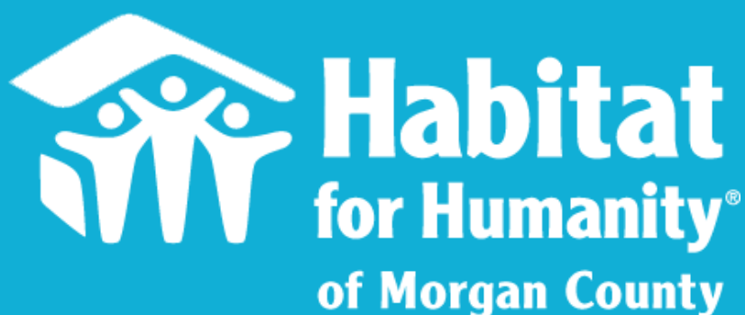
Table Host Guide

Habitat for Humanity of Morgan County Annual Fundraiser,