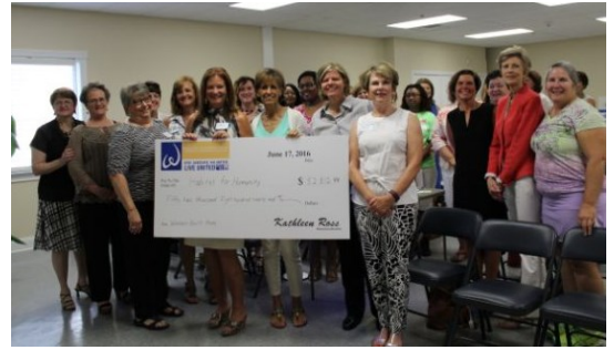
In June, the United Way Women's Initiative presented a check to Habitat for one of our upcoming fall builds.