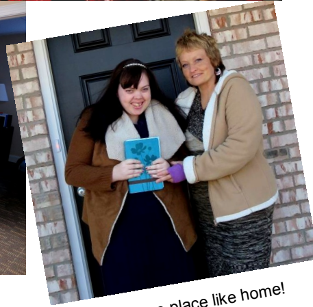
There's no place like home!