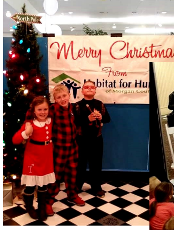
Our PJ Party with Santa was well attended at Decatur Mall in early December.