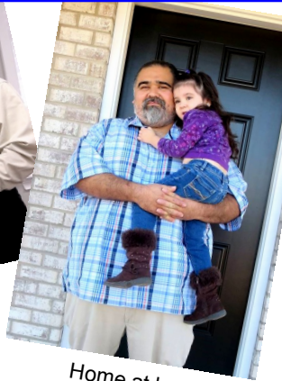
Home at last!