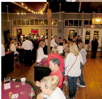
On March 14, the Magnolia Room in downtown Decatur was buzzing with excitement. Our second annual Big Deal casino-style gaming night was a huge success! If you missed it, make plans to join us next year.