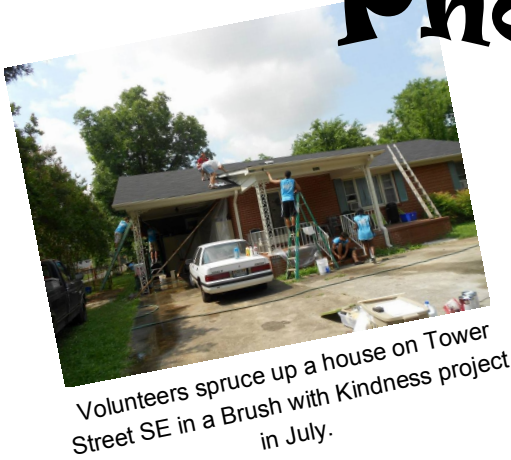
Volunteers spruce up a house on Tower Street SE in a Brush with Kindness project in July.