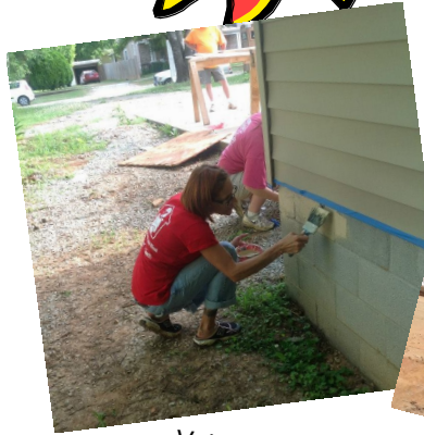
Volunteers put finishing touches on our latest construction project at 1509 Tower Street SE in Decatur.