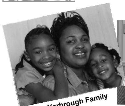
The Yarbrough Family

World Habitat Day was sponsored by Chick-fil-A, Pepsi Cola and Canteen.