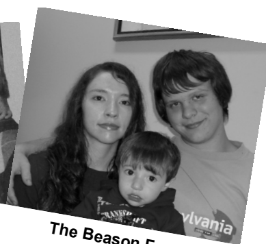
The Beason Family