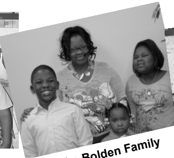
The Bolden Family