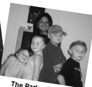
The Parker Family