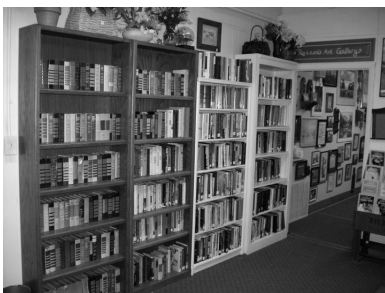
Did you know the Habitat ReStore had books? Lots of them! Stop by and check out the great selection.