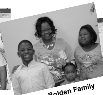
The Bolden Family