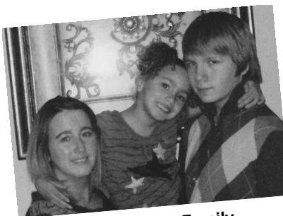
The Kilgore Family