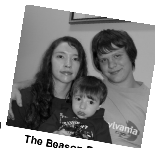
The Beason Family