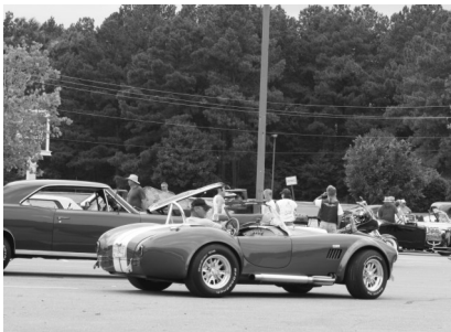
Our third annual Rollin' on the River Car Show was a great success at the Decatur Mall on June 18.