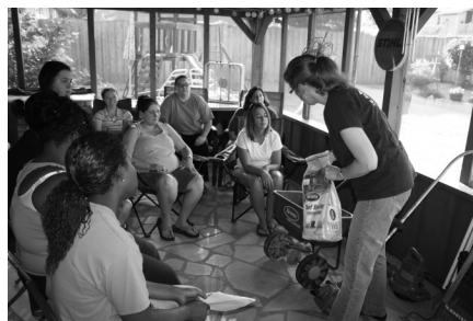
Family Services coordinator talks about using a spreader in a recent Lawn Care and Landscaping class for "homeowners-in-progress".