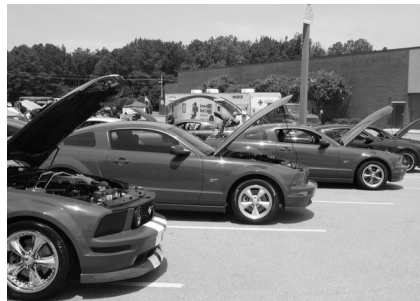
There were dozens of beautiful cars to admire in our last Rollin' on the River Car Show.