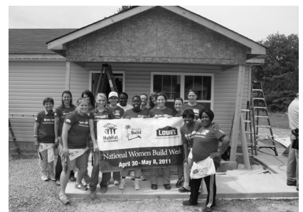
These women gathered in our Hartselle subdivision on May 7 to demonstrate "girl power" for our Women Build event.