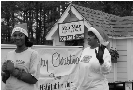
Habitat friends join the ReStore truck and the Habitat playhouse in the Priceville Christmas parade.