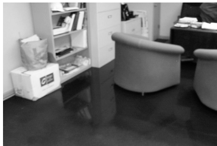
Habitat employees came to work on Tuesday morning (January 4) to discover 2 -3 inches of water covering most of their office floor. The previous day, there wasn't even enough water in the building to flush a toilet--oh, the irony of it all!