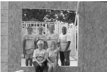
These gals from Eaton Corporation were an invaluable part of the construction crew for the recent Carter house build.