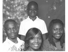
The Carter Family