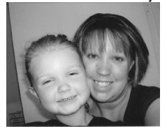
The Russell Family