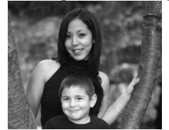
The Nolan Family