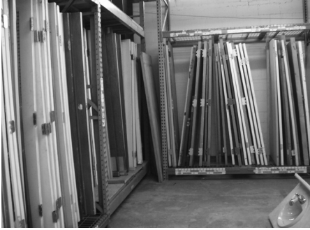
Finding the right size door is so much easier now that they are racked by size and type.