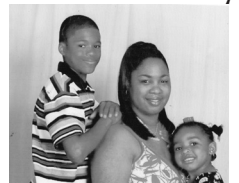
The Yarbrough Family