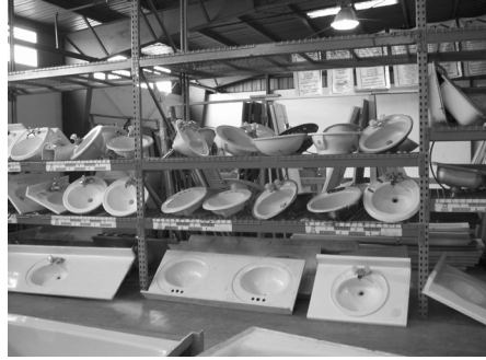
The sinks are more accessible and are grouped by type and shape.