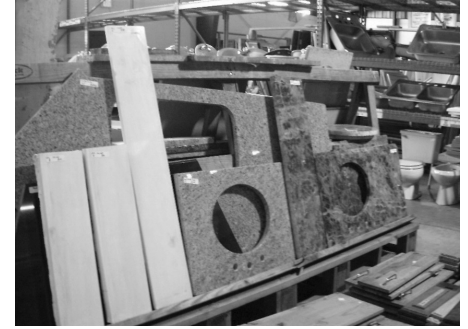
This just in--marble countertops for your bath or kitchen! Choose from a variety of colors and styles.

Also, be sure to check out our new and improved pages on the web: www.morganhabitat.org/restore . We've updated the "What We Stock" section and added a "Request Donation Pickup" form.