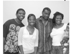
The Swopes Family