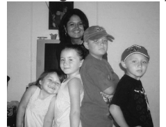
The Parker Family