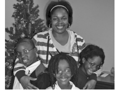
The Ashford Family