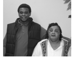
The Fletcher Family