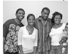
The Swopes Family