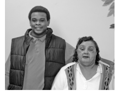
The Fletcher Family