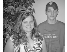
The Brewer Family