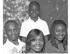
The Carter Family