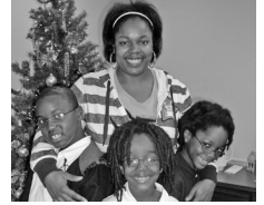
The Ashford Family