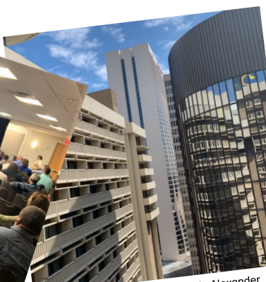
Atlanta Skyline