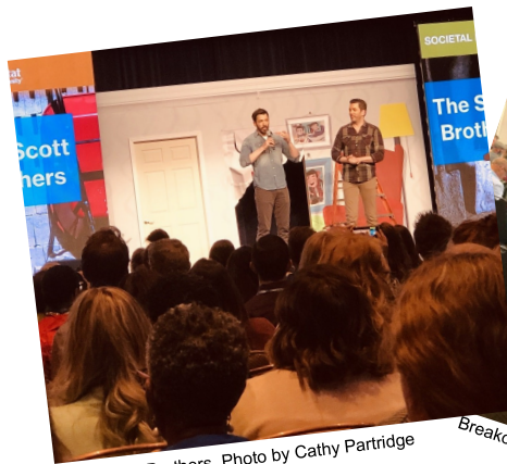
Property Brothers, Photo by Cathy Partridge