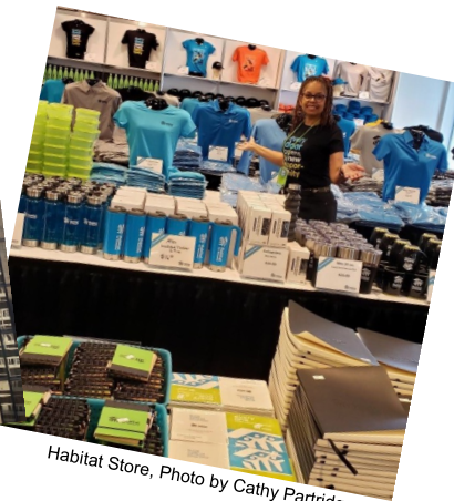
Habitat Store, Photo by Cathy Partridge